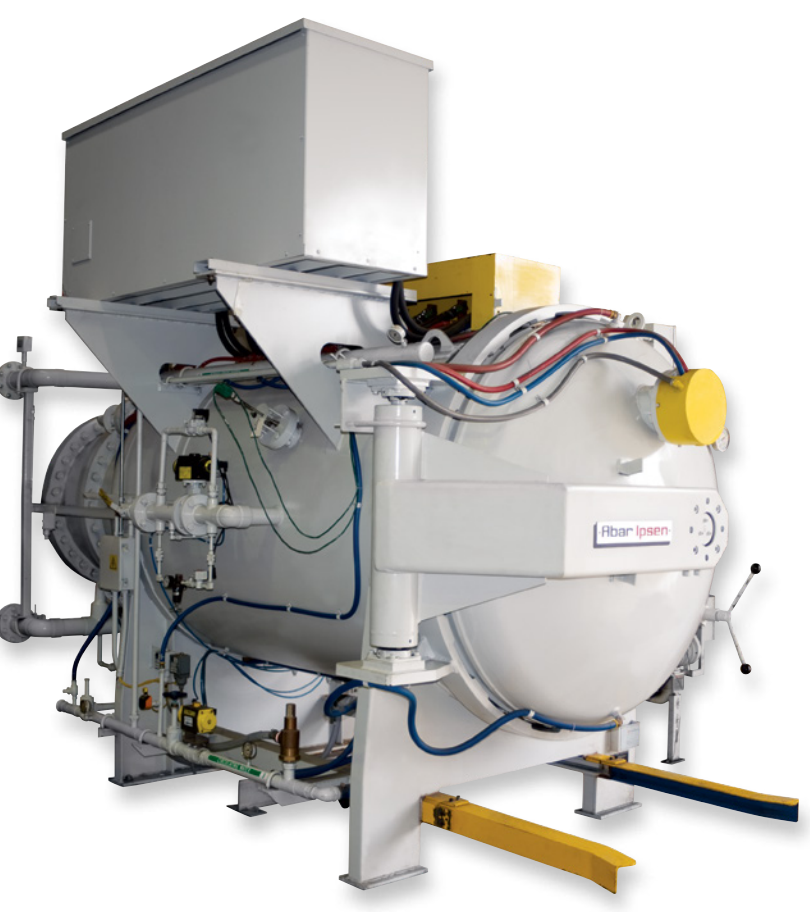
12 bar TurboTreater® vacuum furnace 1 tonne capacity Furnace Capacity 600mm x 600mm x 1000mm

Our experienced technicians accurately record all processing parameters and monitor all processing variables. They will work directly with your material, design or manufacturing engineers to determine the optimum processing methods to meet your requirements.