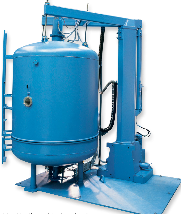
NitroPlas Plasma Nitriding chamber 5 tonne capacity Chamber Capacity 1.2m diameter x 1.5m high